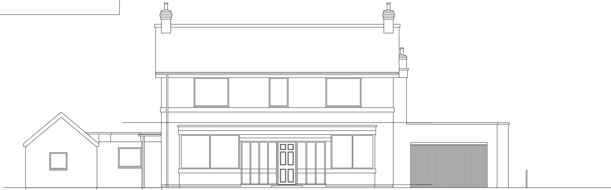
elevation A - south eastern elevation